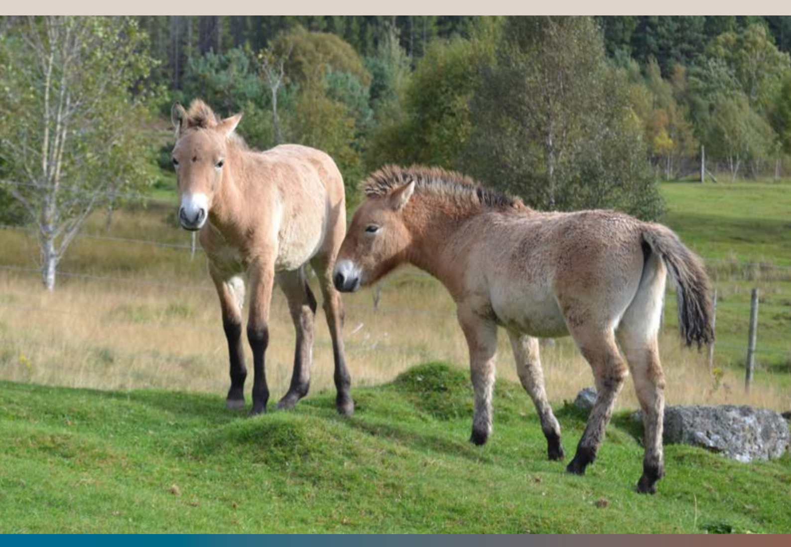
Brought to you by The MiMer Centre and Touching Wild

Current guidelines for the local areas will be followed.