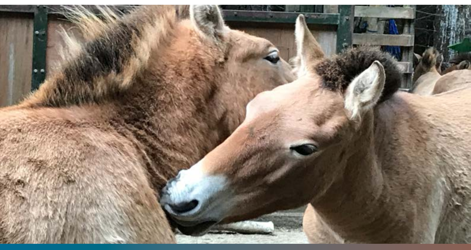
Brought to you by The MiMer Centre and Touching Wild

During the week we will visit the Highland Wildlife Park where you will have the chance to learn about the Mongolian wild horses who live there (aka Takhi or Preswalski). This will include meeting these rare and endangered equines and their keepers. There will also be the opportunity to watch the horses being worked with and learn about the concepts behind how and why they are handled. You will also hear lots of information about the breed, their history and their lives in Mongolia. There will be some free time to explore the rest of the park.