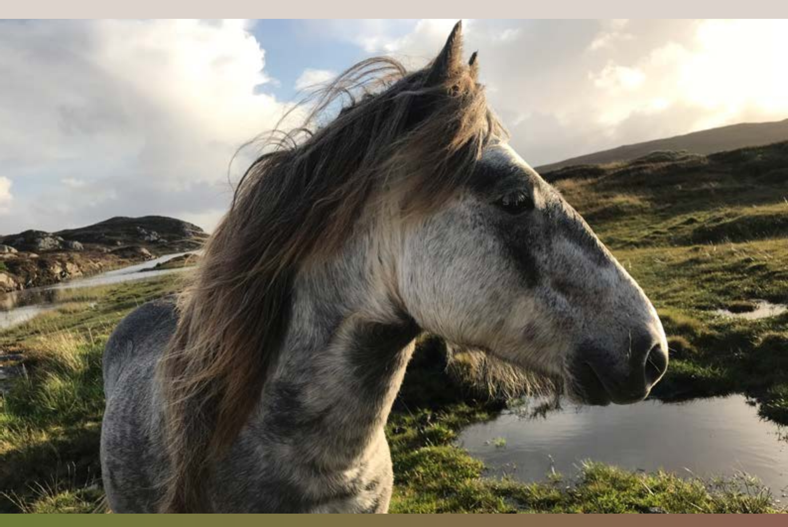
Brought to you by The MiMer Centre and Touching Wild

Current guidelines for the local areas will be followed.